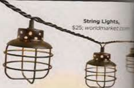
String Lights, $25; worldmarket.com